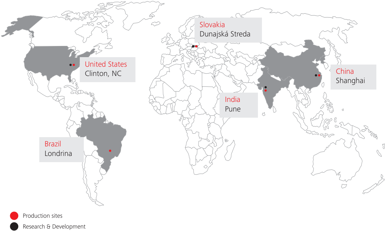
Production sites of Schindler escalators and moving walks

Schindler moves people and materials and connects vertical and horizontal transportation systems through intelligent mobility solutions driven by green and user-friendly technologies. Schindler products can be found in many well-known buildings across the globe, including residential and office buildings, airports, shopping centers/retail establishments, and buildings with special requirements.