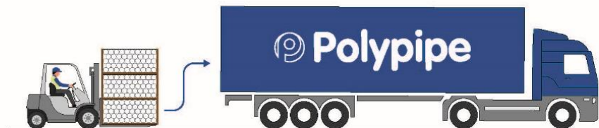
Step 4 The product is then loaded onto a lorry and dispatched.