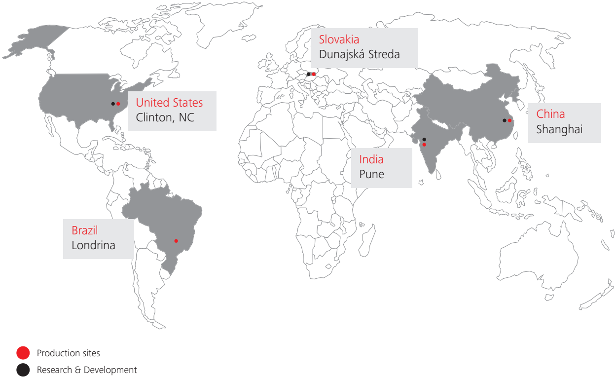
Production sites of Schindler escalators and moving walks

Schindler moves people and materials and connects vertical and horizontal transportation systems through intelligent mobility solutions driven by green and user-friendly technologies. Schindler products can be found in many well-known buildings across the globe, including residential and office buildings, airports, shopping centers/retail establishments, and buildings with special requirements.